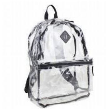
Example of permitted clear backpack.

All bookbags (backpacks) carried by students in grades 1–12 must be clear. Clear bookbags are options for Pre–Kindergarten and Kindergarten students. Students will carry their laptops in the school–issued, non–transparent laptop bag. Students participating in an extracurricular activity are permitted to carry non–transparent bags to store items pertaining to their particular activity (i.e. band, athletics, etc.). Upon entry into the school, all extracurricular activity bags must be stored in lockers or designated areas. All bags are subject to search. Additionally, the maximum size for non–transparent bags that students will be permitted to carry during the school day, such as lunch kits, pencil bags and purses, will be 6” x 9”.